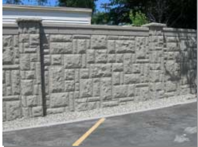
New Sandstone Wall Design