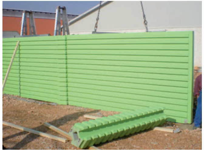
The installation of the Verti-Crete walls is very simple