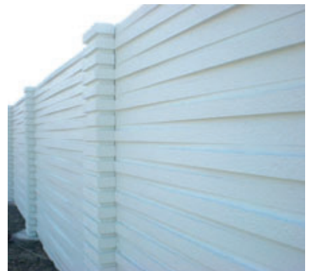
Recap launched its precast wall offerings with five custom patterns that are unique to the Italian market