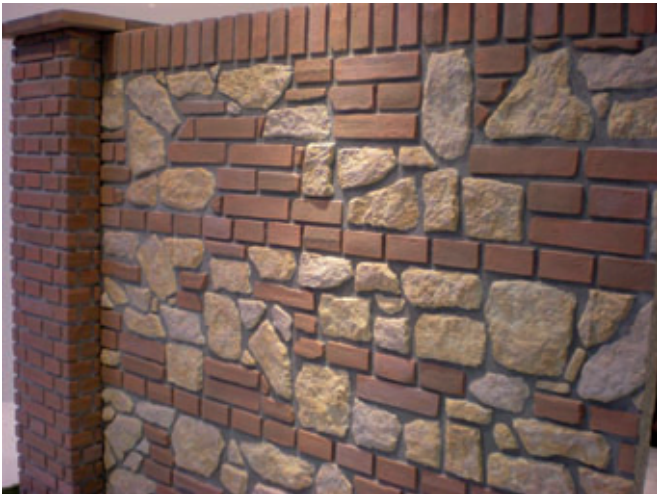
After being trained by Verti-Crete in the concrete staining, Recap meticulously creates realistic stone colors in a process that's surprisingly fast