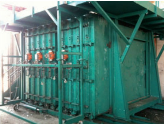
The patented Verti-Crete system produces two-sided concrete wall panels

a process that's surprisingly fast. Architects and customers alike appreciate the flexibility of the look—and the difficulty telling Recap's product apart from actual masonry.